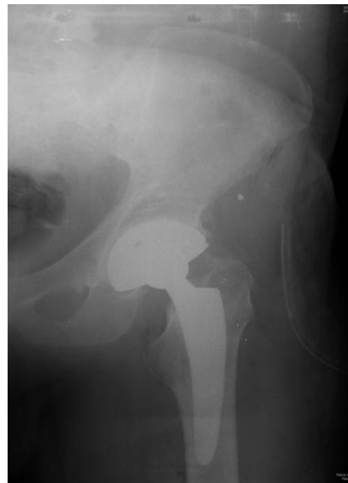
Figure 2. Radiography of the pelvis immediately after left hip arthroplasty with total cementless endoprosthesis with Zimmer Fitmore® Hip Stem