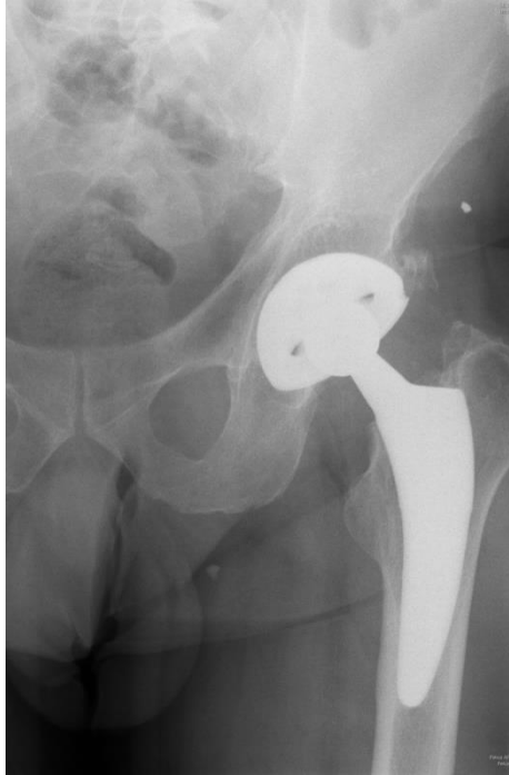
Figure 3. Follow-up radiograph of the pelvis 3 years after left hip arthroplasty. We can see the cortical hypertrophy in Gruen zone 5