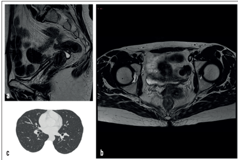
Figure 3. Follow up (February 2020): a) Sagittal and b) axial pelvic MRI scans with part of cervix - without signs of tumor recurrence, c) non-contrast axial scan of thorax after treatment -without signs of disease in lung parenchyma

symptoms (vaginal bleeding, hemoptysis etc.) clinical diagnosis is difficult (8). Smith et al. made age-specific incidence which showed that choriocarcinoma has higher rates in patients younger than 18 and older than 40 years (9). Choriocarcinoma can develop in any time between 5 weeks to 15 years after gestational event (10). Above mentioned data about age incidence and time between gestational event and appearance of malignancy are in accordance with our data. McGrath et al. indicate that woman with pre-treatment \beta -HCG values >100000 and <400000 can be treated with low-risk single-agent therapy, because it is less toxic than multiple-agent therapy (11). Beside the fact that single-agent drug therapy is less toxic, it will only prolong treatment by two weeks if a change to multiple-drug treatment is required (11). We started treatment with single drug agent methotrexate. After two series tumor developed resistance that could be expected because only 30% of patient can be cured with single agent therapy (11).