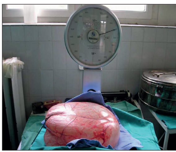
Figure 4. Macroscopic finding and weighting of the cyst

Prolapse of the uterus most often occurs in the elderly patients and is closely related to difficult and long-lasting deliveries, in women who had multiple pregnancies, twin pregnancies or infants weighing over 4 kg, but also in patients with long-term cough, asthma and bronchitis, enormous obesity and is associated with a lower estrogen levels in the postmenopausal period (6). Uterine prolapse is the third most frequent indication for hysterectomy (7).