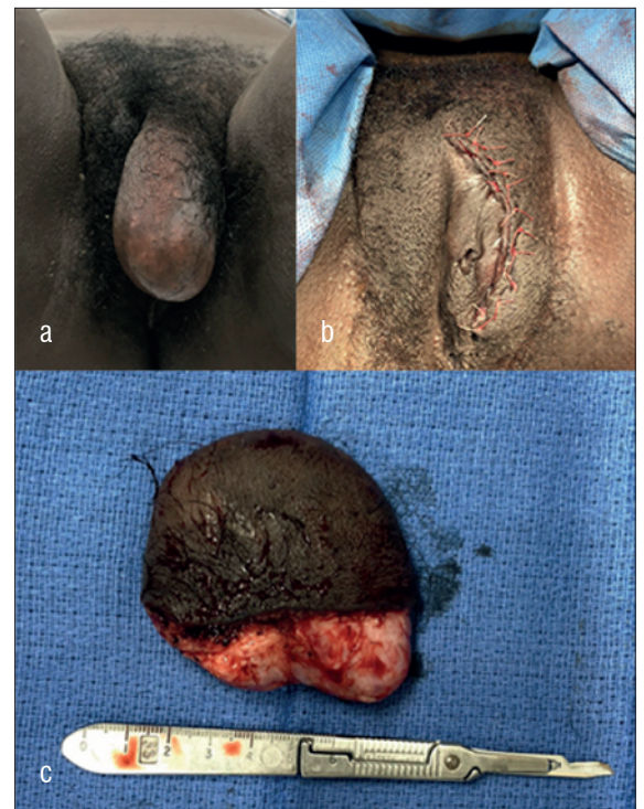
Figure 1. Macroscopic aspects of the lesion: a) large rubbery firm mobile mass arising from left vulvar region; b) post-surgical wide local excision; c) macroscopic appearance of the lesion. Note the dark-white and glistening area with firm rubbery texture.

Our case describes a rapid enlarging vulvar tumor in a young patient with a history of recurrent PASH of the breast. PASH is a benign hyperplastic condition typical of the breast. It is the result of the stromal myofibroblasts hyperplasia in response to hormonal stimuli and is characterized by complex channels with a spindle cell lining (9–12). It is extremely rare in the vulva and probably arises from the anogenital mammary-like glands (AGMLG) tissue. Accessory breast tissue can be found anywhere along the milk line, from the axilla to the groin (13). Initially considered ectopic breast tissue, AGMLG tissue is considered a normal part of the anogenital area (14). Histologically, it appears with slit-like spaces in the