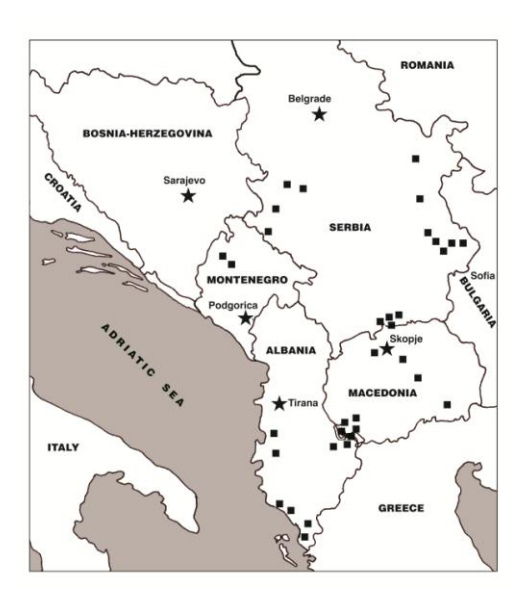
Figure 1. Collecting localities in 2014, 2016 and 2017 are indicated approximately by the solid black squares. Some squares represent more than one locality. The positions of the squares are not precise; refer to Tables 1, 2 and 3 for precise coordinates.

The geographical spread of these sites is indicated in Fig. 1.