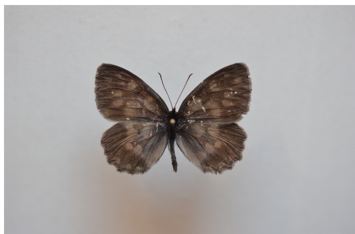
Figure 7. Melanargia galathea ab. nigrata Schröder, 1924.

Erebia alberganus would appear to be a relict species, restricted, as it is, to warm grasslands and meadows, often sheltered by woodland, in mountainous regions Tolman & Lewington (2008). Thus it is found extensively in the Alps, but also exhibits a somewhat disjunct distribution overall, in the Apennine Mountains of Italy, the Cantabrian Mountains of N Spain and several isolated localities in the Balkans.