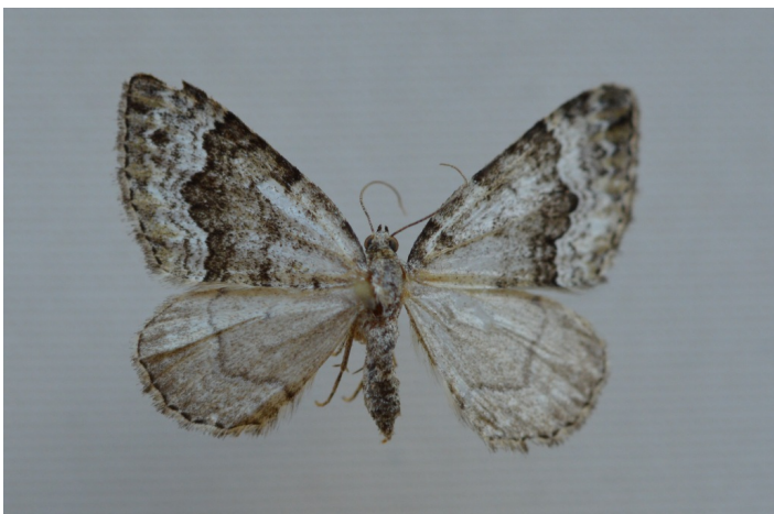
Figure 9. Colostygia aptata (Hübner, [1813]).

Widely distributed across the Palaearctic and has previously been found in other localities in the Balkans. This is a moth of dry, rocky, sunny grassland slopes and the fringes of forests, with poor soil, on mountains. The larvae feed on Galium spp Skou & Sihvonen (2015).