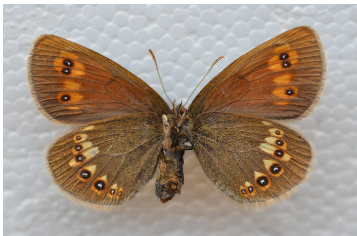
Figure 5. Erebia alberganus (De Prunner, 1798).

Pseudophilotes vicrama schiffmuelleri (Hemming, 1929), Orjen Mt., Subra, 1167 m, 30 June 2020 (Fig. 4).