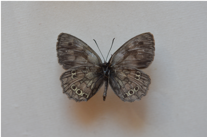
Figure 8. Melanargia galathea ab. nigrata Schröder, 1924.