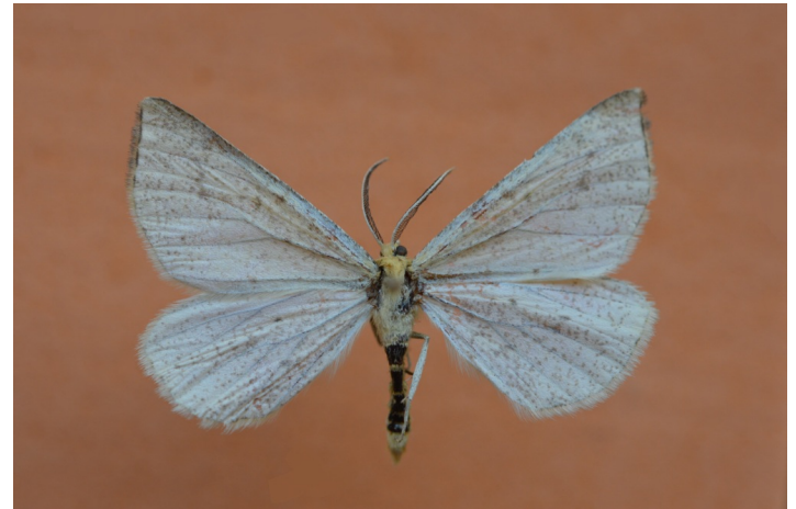
Figure 10. Hypoxystis pluviaria (Fabricius, 1787).

Hypoxystis pluviaria (Fabricius, 1787), Sušica River Canyon, 1180 m, 7 May 2017, two males, one female. Genitalia checked, slide CG-2894. (Fig. 10)