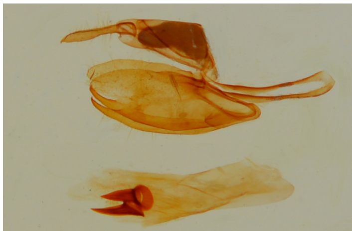
Figure 12. Eilema pygmaeola (Doubleday, 1847).

Eilema pygmaeola (Doubleday, 1847), Durmitor Mt., Veliki Štuoc, 1930 m, 22 July 2017, one male. Genitalia checked, slide CG-2904 (Fig. 12).