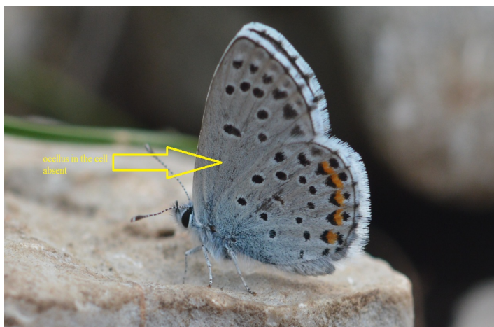
Figure 4. Pseudophilotes vicrama schiffmuelleri (Hemming, 1929).

Phengaris arion (Linnaeus, 1758), Maglič Mt., 1287 m, 11 July 2018, one female.