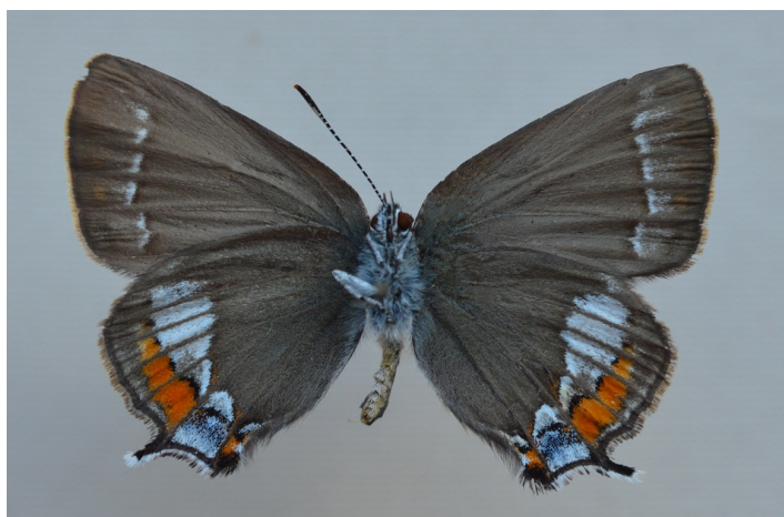
Figure 2. Satyrium spini f. albosparsa Oberthür, 1910).

one female; Orijen Mt., Bijela Gora, 974 m, 28 June 2020., one female. (Fig. 1). Genitalia checked, slide DU-2935.