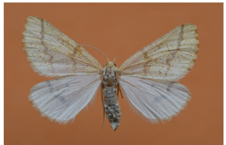
Figure 11. Aspitates ochrearia (Rossi, 1794).

Distributed in western and southern Europe. Already known from Bosnia & Herzegovina. The habitat of this moth is dry grasslands and dunes. The larvae eat a number of low-growing plants, including Daucus carota , Plantago cornopus , Ononis spp, Linaria spp, Artimesia spp, Vicia tetrasperma and Crepis vesicaria . A new species for Montenegro. (Fig. 11).