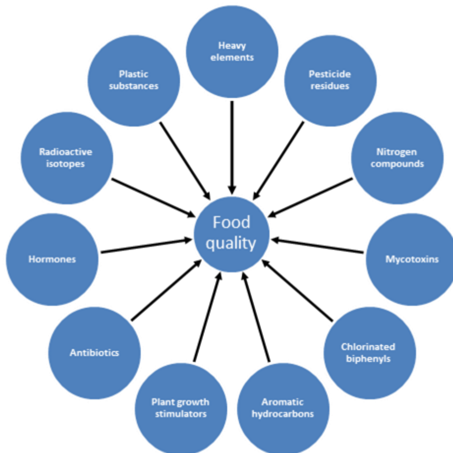
Figure 1. Pollutants that affect food quality

Consumers in most countries have a positive attitude towards organically produced food. Considering that the system of organic production is fully legally regulated and the mandatory certification by competent certification institutions is required, consumers recognise organic products as safer and sounder to consume (Codron, Siriex & Reardon, 2006). In this regard, the most common motif for consuming organic products is taking care of their own health, because consumers believe that organic products are healthier and with a higher content of nutrients compared to conventionally produced foods (Marques Vieira, Dutra De Barcellos, Hoppe & Bitencourt da Silva, 2013; Golijan & Veličković, 2015).