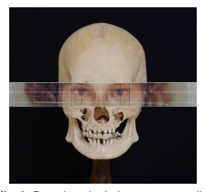
Slika 9. Presek preko jednog segmenta lica. Figure 9. Box Sweep.