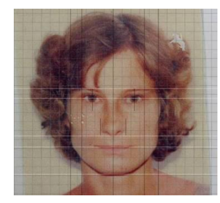
Slika 4. Oznaka antopometrijskih tačaka lica pomoću linija. Figure 4. Anthropometrical face's points are marked by lines.