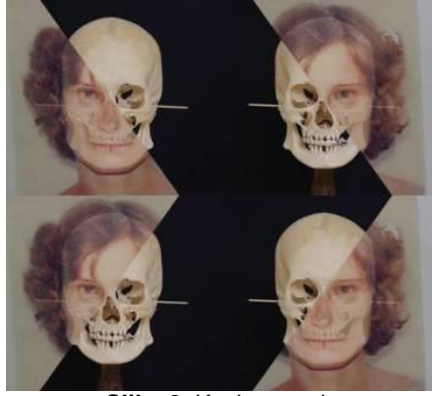
Slika 8. Kosi preseci. Figure 8. Diagonal Sweeps.