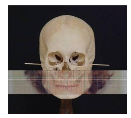
Slika 10. Presek preko donjeg sprata lica. Figure 10. Box Sweep.