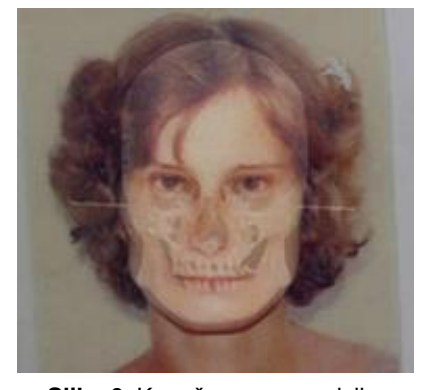
Slika 6. Konačna superpozicija. Figure 6. Final superimposition.