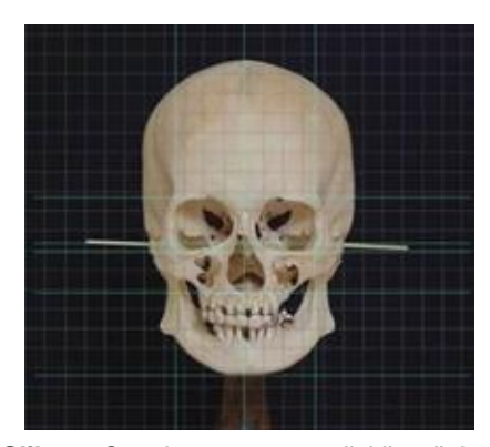
Slika 3. Oznaka antropometrijskih tačaka lobanje pomoću linija. Figure 3. Anthropometrical skull's points are marked by lines.