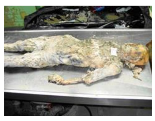
Slika 2. Ceo izgled saponifikovanog leša. Figure 2. The open display of the saponificated corpse.