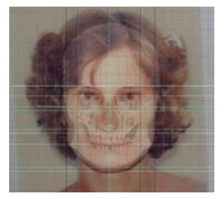
Slika 5. Superpozicija oba digitalna snimka. Figure 5. Both digital snapshots superimposition.