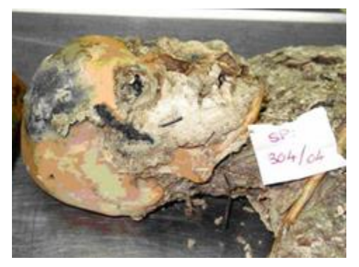
Slika 1. Izgled lobanje saponifikovanog leša. Figure 1. Look of the skull of a saponificated corpse.

Chronological and logical sequence of all work stages is presented on the photographs..