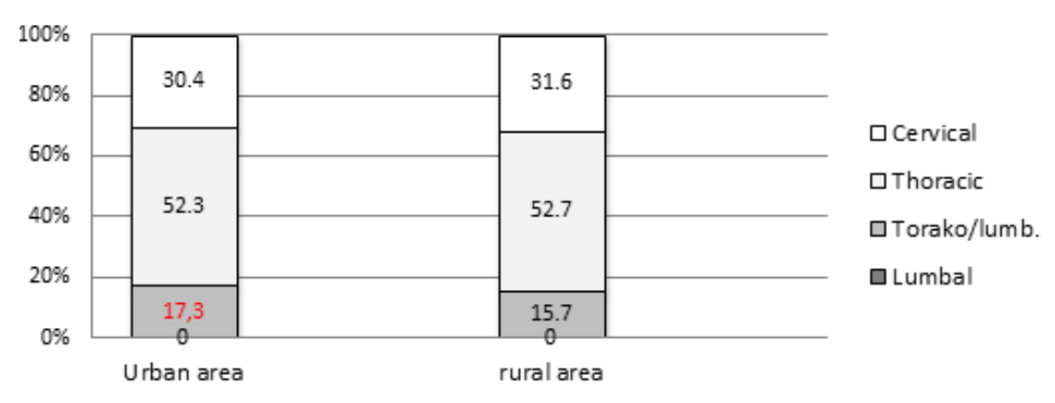
Graph 2. Relative frequency of partial scoliosis in girls depending on the location of deviation

The results of this research have shown that partial scoliosis (PAR) is differently distributed in girls from urban and rural areas (Table 2 and Graph 2). Thoracic scoliosis is most present (TOR), often with the top of the curve at the height of V and VII thoracic vertebrae, and often with left convexity. One school girl had the most severe form of this deformity. Somewhat lower percent refers to cervical scoliosis (CER), structural form of this deformity has been detected in two girls from rural areas (CER). A detailed investigation of the girls indicated that it was the case of a curve in the neck. There was a significantly lower number of cases of thoracolumbar scoliosis (TLB). All three types of scoliosis have proven to be similarly distributed in girls from different socio economic background. It is interesting to note that lumbar (LUM) has not been registered in girls who participated in this research.