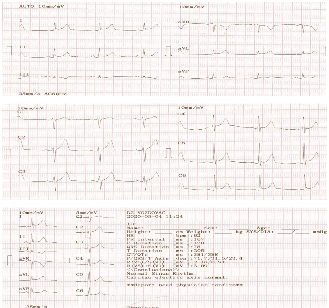
Figure 1. The ECG recording showing an ST-segment elevation in lateral leads recorded at the Community Health Center Vozdovac infirmary (HR 62 bpm, ST-segment elevation in I, II and V2-V6 leads)

back many years. He did not have a respiratory infection and the epidemiological survey for COVID-19 was negative (no contacts significant for the epidemic, no travelling outside the country, non-smoker). On examination, the patient was conscious, oriented, communicative (Glasgow Coma Scale - GCS 15), subfebrile (37.1°C), normotensive (130/70mmHg), eupneic (RR 18 breaths/min), with normal auscultatory breath sounds and a blood oxygen saturation level of 98% on room oxygen. Heart sounds were of regular rate (62 bpm) and rhythm, with no murmurs above the precordium and no signs of decompensation. The electrocardiography (ECG) recorded at the Health Centre showed an ST elevation in lateral leads ( Figure 1 ), which was later confirmed on the ECG recorded by the emergency medical system - EMS ( Figure 2 ).