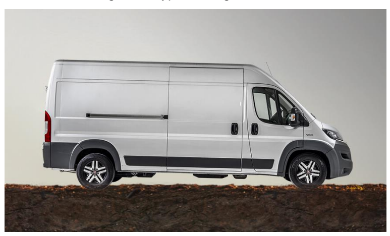
Figure 1. Typical refrigerated van

In addition to the values of the overall coefficient of heat transfer provided, aforementioned types of insulation also differ in price. Based on information obtained from the bodybuilders, the price of better-quality thermal insulation for the considered vehicle is \in 3500, while the price of insulation with a material that has inadequate thermal insulation properties is \in 2000. The aim of this research is also to show for how much the investment in better-quality thermal insulation progration for the mechanical refrigeration unit drive.