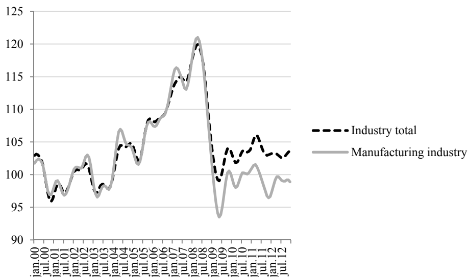
Figure 2 - Industrial production dynamics after 2000 (Physical volume index, 2000=100, trend-cycle)