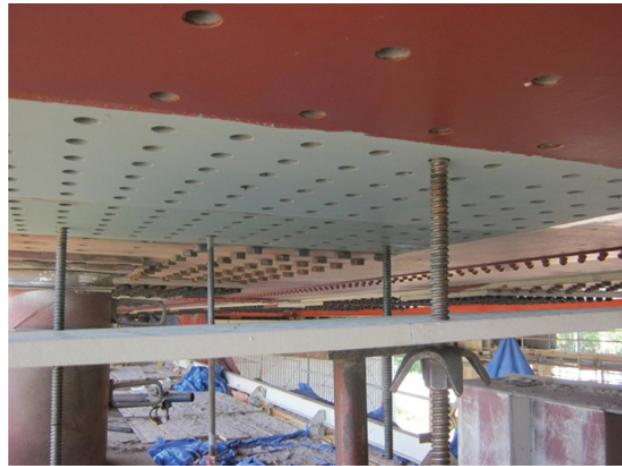
Figure 2: Reconstruction of the „Gazela“ bridge in Belgrade – implementation of zinc-silicate coating „Resist 86“ as anti-corrosive protection of friction surfaces [09]