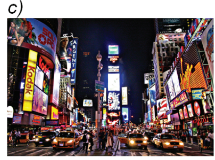
Figure 6: a) Times Square 1904 – before the era of media façades, b) Times Square – during the day, c) Times Square – during the night [19]

In the 2000 Charter of Zurich "interactivity" was classified into nine points of "new architecture". Interactivity is defined as: "closely related to the development of new intelligent materials, not only responding to the environmental conditions but also conditioning their structural changes and adjustments" [Rogina, 2011]. The fact that cities like New York are considered media cities is truly justifiable. Reference points in such cities are no longer defined by streets, corners and squares, but by media façades or ensemble of buildings designed in the spirit of media technology. This type of public spaces replaced the former public spaces with classic aesthetics, becoming the spaces of permanent circulation, so it appears like the implemented screens are competing to attract more attention and acquire a dominant position in the sound and colour drama. Cities like New York and Tokyo now "speaks, it emotes, at night as in the day" [Lefebvre, 2004]. Buildings expand into infinity, with only one aim, to provide more space for marketing activities. Buildings