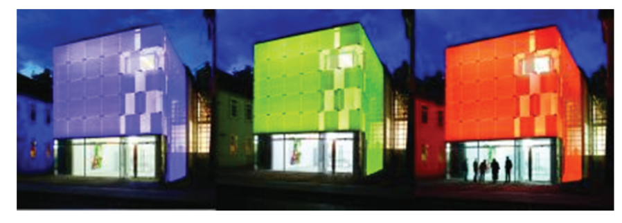
Figure 5: 2006: Museum of Art - Ahrens Grabenhorst Architekten BDA Hannover