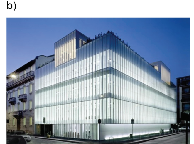
Figure 4: a) 2009: Moderna Museet Malmö - Tham & Videgård Arkitekter, Malmo, Sweden, b) 2006: Dolce & Gabbana Headquarters - Studio Piuarch, Milan, Italy

Achievements in the development of technologies and materials have encouraged architects in their conceptual programmes, so they have found a model for architectural works to exist during the night, by insisting on their dual nature and recognisability: during the day – by interesting volume, during the night – by light-transparent façade. Owing to the development of LED technologies, façade is now able to exist unobtrusively during the day, while during the night, when it is not possible to view urban environment, it is transformed into new spatial values. The permanence of change in the example of