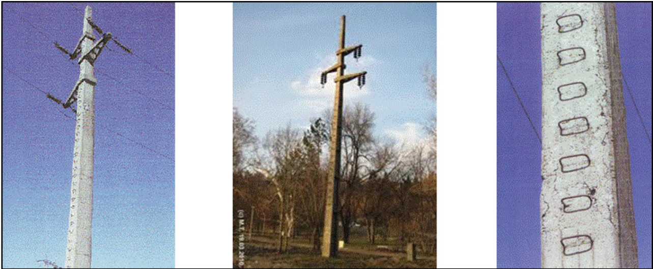
Figure 1: Condition of poles