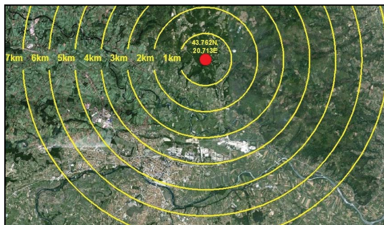
Figure 1. Epicenter of the main quake (Kraljevo, 03.11.2010)

After the main earthquake, a series of following tremors were registered in the area. Their magnitudes ranged from 1.0 to 4.4 degrees of the Richter scale. Those quakes of 2 degrees and below were only detected by instruments and could not be felt. During the interval of time until 1pm on November 9, 2010, the cluster of 258 earthquakes in total were registered. [3]