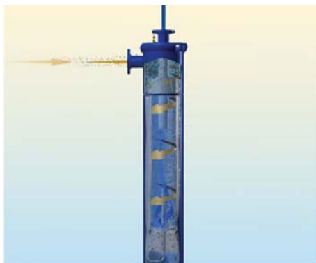
Figure 2: LAKOS eJPX Centrifugal Separator for industrial applications [19]

The figures show that the fluid flows in both devices look similar.