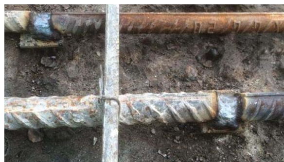
Figure 4: Rebar butt welding

This method of rebar welding is designed for foundation and other large reinforced concrete products, complex frames when constructing different buildings. It ensures the preservation of the strength of parameters and structural rigidity along the entire length. Such welding of a rebar enables to create a single bearing frame. The joining can be made both horizontally and vertically. Tub welding of a rebar of columns and other vertical products can, therefore, be carried out without moving them and bringing them into a horizontal position. Another advantage is that standard devices are used to make the joining, as in electric arc welding.