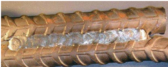
Figure 1: Rebar joining by lap welding

Figure 1 shows arebar joining by lap welding [2].