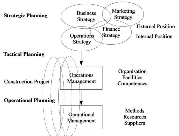
Figure 1: Levels of operations and strategies in a single-business construction company [35]

Competitive advantage in Indonesia's construction company can be achieved through HRM practices to build and improve the safety culture that will increase employee productivity. The Company must integrate this practice with a culture of safety as the company's priority strategy because, based on empirical results, safety culture can be a competitive advantage for construction companies in Indonesia [36]. It is important to know how HRM practices can help companies from labour issues constraints to understand how companies can safeguard their human resources, [37]. Other factors that can support competitive advantage for the company include organizational culture, competency, confidence, motivation, organizational commitment, career development,