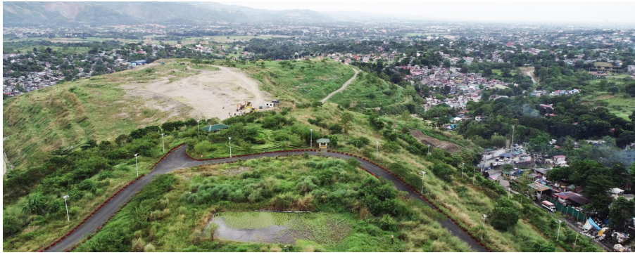
Figure 2: Payatas Controlled Disposal Facility, Quezon City, Philippines