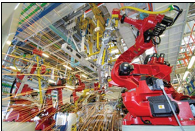
Figure 7: Production flexibility [12]