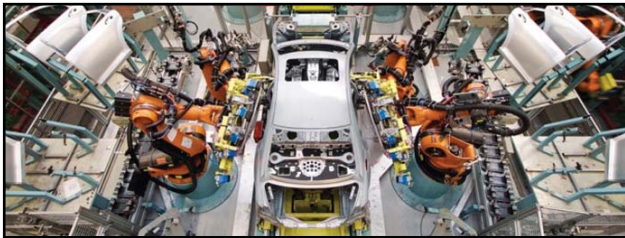
Figure 5: Production monitoring over Cloud [08]

This type of monitoring is very expensive and difficult to maintain due to the huge amount of data that is generated. Microsoft has Azure Cloud platform which monitors these operations. Companies can significantly reduce the cost of their own infrastructure and support with the Windows Azure platform and take advantage of cloud technology. [18] On Figure 5 in some vehicle models there are millions of possible combinations of optional equipment.