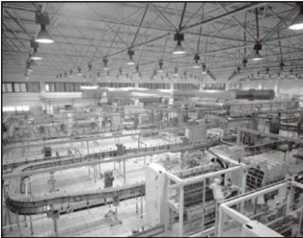
Figure 1: Machines in the production process [07]

we produce and consume. Machines in the manufacturing process must support more features and the human factor must be trained to adapt for market needs. On Figure 1 workers must to prepare for new techniques and working procedures.