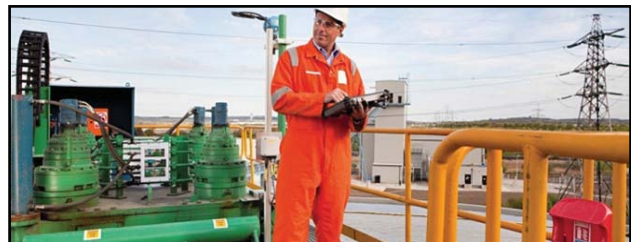
Figure 4: Application access from anywhere [10]

An example is a technician who works in the plant, who uses the tablet computer application to access the site from any point and thus not tied to your job or office. On Figure 4 a heating company technician can use a tablet computer to access the latest maintenance program on site at any time.