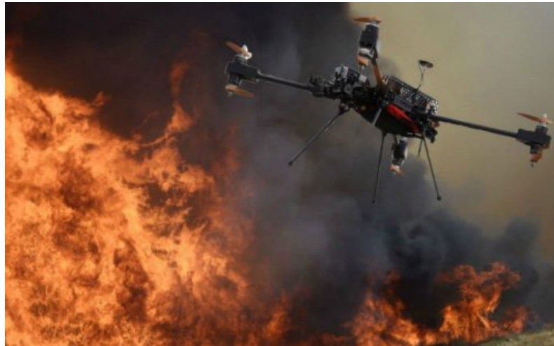
Fig. 1. Example of monitoring dangerous fire area using multi-rotor UAV.

Therefore, the task of calculating stay time of UAV in dangerous area, taking into account limitations of UAV's loss probability, is practically important and relevant.