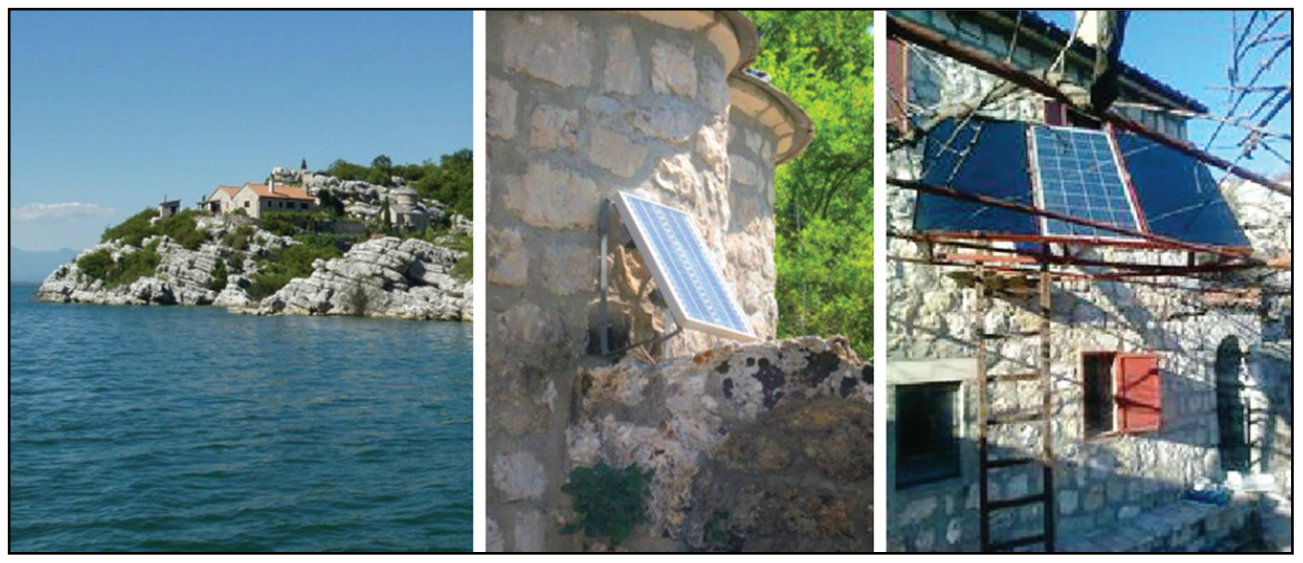
Figure 4: The Starcevo monastery with solar panels mounted on the church walls [16]

Currently the Starcevo monastery church has solar panels directly on the walls, which are constantly criticized by the specialists in the field of restoration.