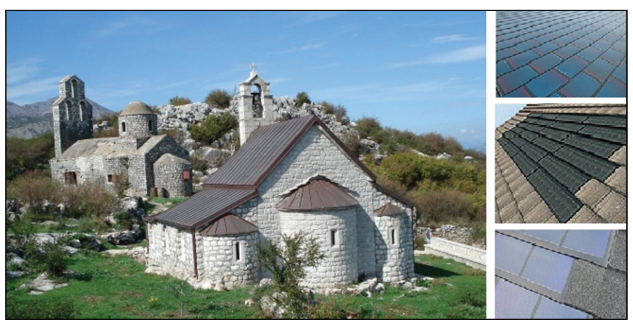
Figure 2: Building-integrated photovoltaics (BIPV). The Beska monastery, model

We prefer Building-integrated photovoltaics (BIPV) and "camouflage" methods, where we're using the principle of minimal impact on the original appearance of the building (Figure 2, 3).