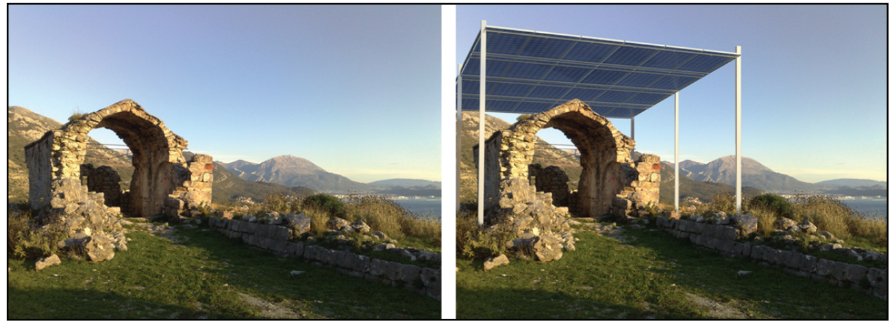
Figure 5: St.Demetrius' Church. Model of building-independent temporary photovoltaic construction (BITPVC)

In the present research we used flint solar modules. Their hard framework allows to produce a portable covering with metallic posts and sec-