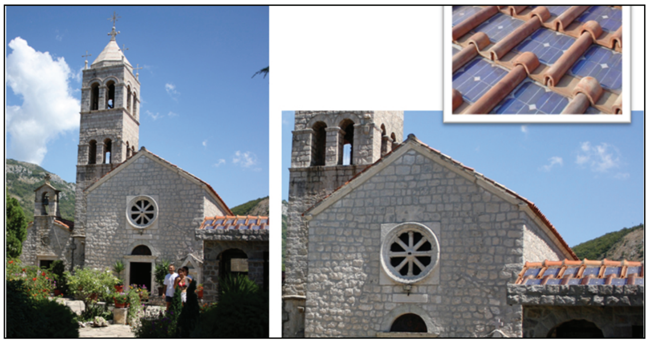
Figure 3: Monastery Rezevići. Model of photovoltaic elements integrated into the roof tiles

If this location is considered to be unacceptable, it is advisable not to place solar modules on an object, but near it.