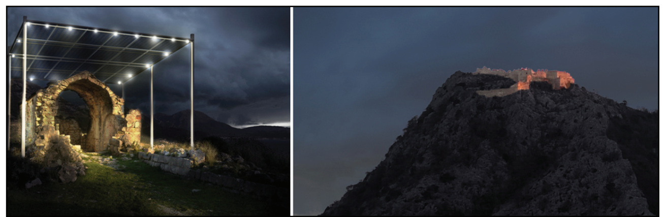
Figure 6: Model of night lighting of St. Demetrius' Church and Nehaj Fortress

tions. The solar energy, accumulated in the day time, will light an object at night (Figure 6).