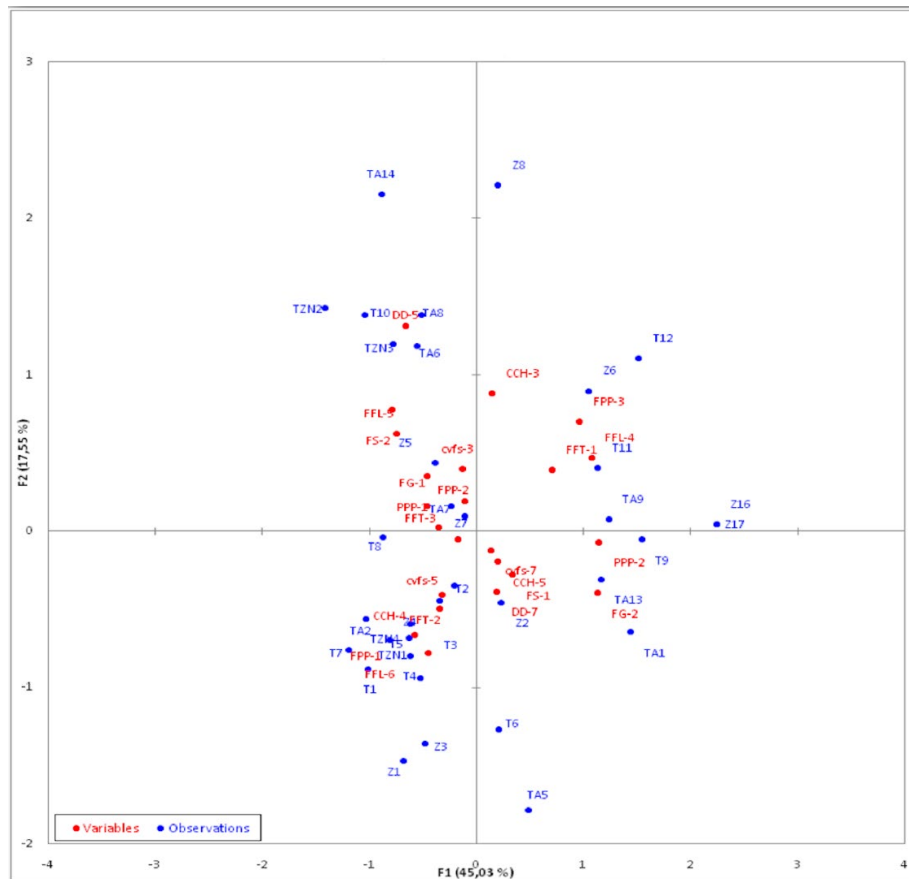
Figure 2. The graphical representation of the 35 genotypes and modalities.

plasticity and adaptability of the species to various environmental conditions (Drobná, 2010). The genetic diversity observed in the Moroccan loquat could be due to the seed propagation practiced by farmers, which can generate a large polymorphism.