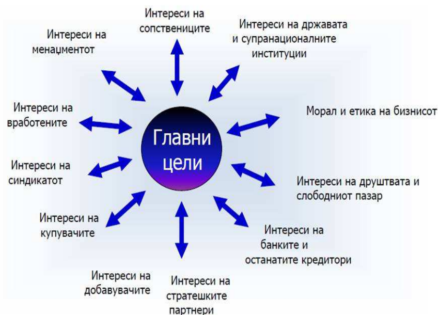
Picture 3 Determination of the company's goals in a system with good corporate governance

Every modern company that wants to be competitive in the global market, which tends to long-term economic growth and development is faced with the challenge of creating wealth in a responsible way for all key stakeholders. To be ethical, responsible and profitable it is imperative for every company. As social antibodies were with pluralistic interests and goals the company must harmonize different interests in terms of easier realization of the economic order.