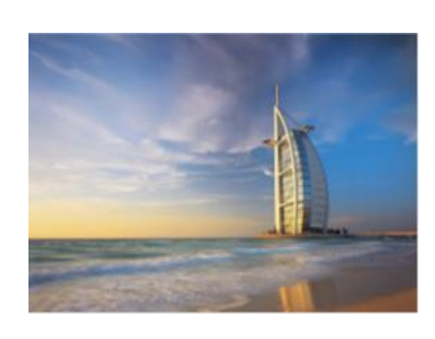
Fig. 8 the Burj-Al-Arab

At that time Dubai was early in its development, this helped the Burj-al-Arab gain this position without too much rivalry. Nonetheless the factual testament to its originality status is its capability to continue one of the strongest symbols of Dubai. Also, there are a numbers of different features of the design that contributes to the originality status of this building. On the other hand, the thing that isolates it from any other developments on the mainland is the Burj-al-Arab's place on an island, permitting clear views of the building and appealing attention it's always visible [24] .