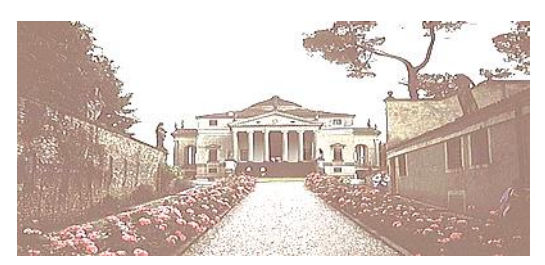
Fig 3. Villa Rotunda, Vicenza, by Andrea Palladio.

Why should we quit from requesting the legitimate right of utilizing the concepts such as, inventiveness originality and creativity? It seems that the practice of classic and traditional architecture benefits from the most imposing sum, not only of the historical evidences, but of the new and the contemporary demonstration of inspired creativity or impressive originality [3]. See figure 3.