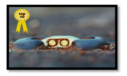
Figure 2.b: Innovative design : product design [7].