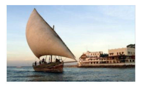
Figure 9: Arabic boat

Furthermore, as a design concept Wright used the old-style (Arabic boat) to stimulate the form of the building which can be seen in figure 9.Through the great double skinned, Teflon covered woven cut-glass fibre screen mimicking a sail billowing in the breeze which reflects Dubai's maritime inheritance joint with modern design moving into the future[11].