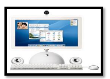
Figure 2.a: Apple G4 [7].

Consequently, 'Design' is what connects innovation and inspiration. It forms notions to become attractive propositions and a realworld for clients or consumers. It might be defined as originality deployed to a precise conclusion. [7]. See figure 2. a and b