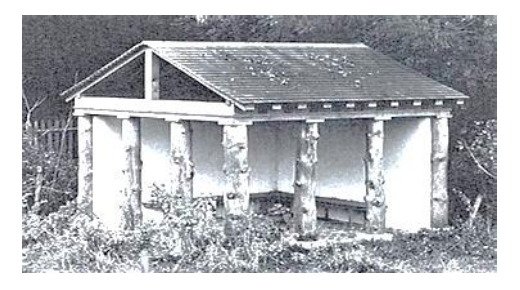
Fig 4. Originals and origin: Garden Pavilion, by Quinlan Terry.

Moreover, the term origin means that what something is, like it is, and it could be call nature or spirit. Additionally, the source of something is the basis of its nature. In another meaning, Originals are forms which greatest truly reflect the forms of source [4].