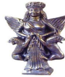
Figure1. The image of Anahita/ Ardi sura Anahita (Pashtunizadeh, 2017:98)

Avestan adjective Anahita (pure), this Anahitish was transformed into the goddess Harhuti Ardi Sura (Boyce, 2002: 89).