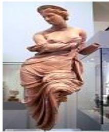
Figure 2. The image of the goddess Aphrodite, the goddess of love and beauty in ancient Greece (Taheri, 2007:52)

This was a very natural and simple childish thing, but since this is the case in many of the various valleys and islands that the Greeks live in, and because these local and ruling gods are more and more were unified with Zeus and Apollon, gradually it seems that Zeus and the Apollon have been merged (Kitto, D., 2014: 240). Greek writers considered this goddess as the Aphrodite Anaise or simply Anaise. According to the Greeks, the goddess was born from the water foam of the sea, with a clear skin and elegant body, slightly farceur and coquets, but far away from the behavior of prostitutes in temples, but self-control (Noss, 1994: pp 142-143).