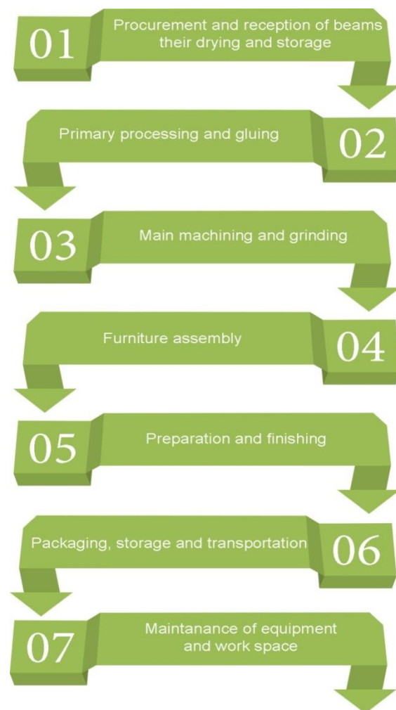
Figure 1. Operations that cover the process of producing wood furniture

The furniture manufacturing industry has been revolutionized over the past several decades. Today, most commercial and production furniture is created by large machinery, much of it automated and controlled by computer. The prevalence of high-tech machinery increases the accuracy and speed of manufacture, but also removes much of the craftsmanship involved. When used well, and with high-quality materials, machines can make solid and attractive furniture. (Jagg Xaxx, Technology Used in Manufacturing Furniture, attached 27 th of April, 2019 on www.ehow.com )