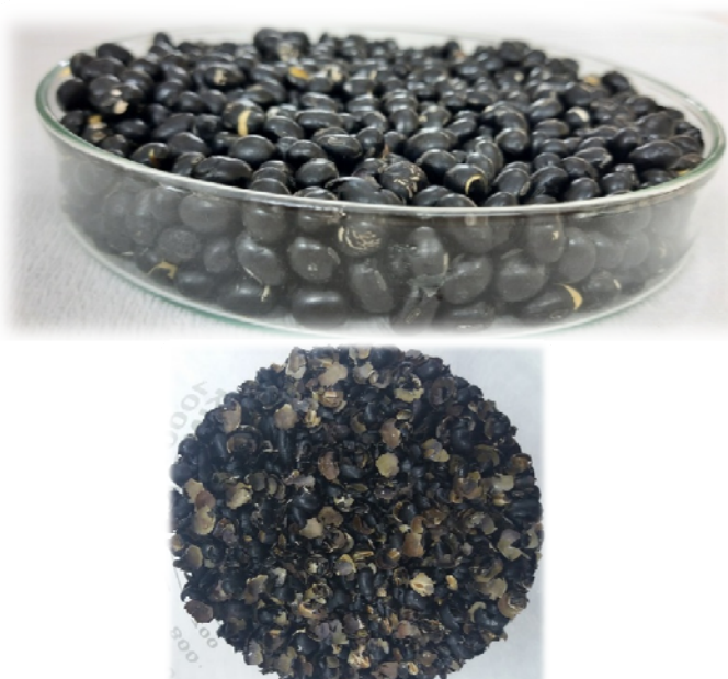
Fig. 1. Black soybeans (left) and seed coat (right)

“Warm” extraction was performed on a magnetic stirrer at a temperature of 50°C for 60 minutes to test the extraction efficiency. “Cold” extraction was performed at room temperature in a horizontal shaker in order to avoid thermal decomposition of bioactive compounds, however, this method of extraction proved to be the least effective. Extraction in an ultrasonic water bath was applied in order to decompose the material, i.e. soybean seed coat, as quickly as possible, and increase the availability of anthocyanins. Warm extraction proved to be the most suitable for obtaining the highest possible anthocyanin yield, as seen in Table 1, and was used in further experiments using lower concentration acetic acid (0.8%) in order to obtain a food product with sensory properties more acceptable for the consumers (adequate pH).