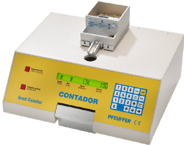
Fig. 1. Photo of the seed counter used in this study

Thousand seed weight was calculated as average of 10 replicates containing 100 seed multiplied by 10. Difference between 1000 seed weight obtained by counter at maximum and reduced speed was tested by ANOVA (single factor).