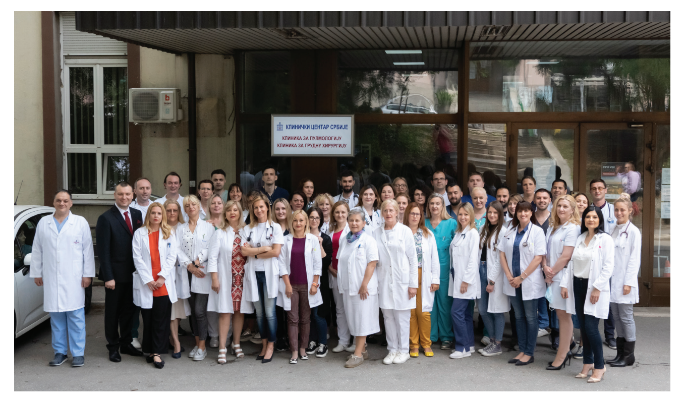
Image 2. The staff of the Clinic for Pulmonology of the University Clinical Center of Serbia on the occasion of the 90th anniversary of the Clinic

Today, the Clinic for Pulmonology is a reference institution for tuberculosis and it participates in the creation and improvement of guidelines for prevention, diagnosis, treatment and rehabilitation in the field of tuberculosis. The Clinic itself consists of an inpatient and a polyclinic-diagnostic center and is a center for carrying out scientific research and teaching activities. As part of its work, the Clinic cooperates with other pulmonology centers in the country and the world. The institution consists of the polyclinic service, the department for the reception and treatment of urgent pulmonary conditions, specialist