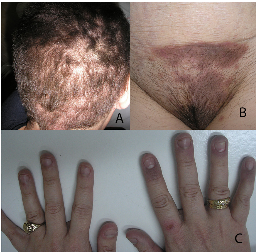
Figure 3. Skin lesions after treatment

After a 2-month therapy, the lesions healed. She continued with a lower dose of Cyclosporine A (2 mg/kg body weight for two months and 1.5 mg/kg t for another three months). In the next 20 months, no new lesions occurred; after that period, new lesions occasionally occurred, almost always preceded by infection (pharyngitis, urinary infections, scabies, and head lice). Cyclosporine A was reintroduced (3.5 mg/kg body weight), with low dose prednisone (0.4-0.5 mg/kg body weight). She was lost to follow-up for four years, during which she experienced periodic flares. She discontinued Cyclosporine A in the past 2.5 years; she