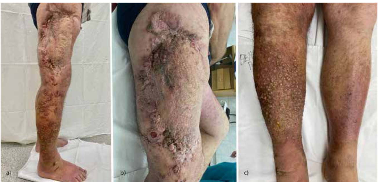
Figure 3. Advanced loco-regional and metastatic disease at the last follow-up. (a) The tumor affecting the entire lower extremity. (b) Tumor recurrence surrounding the site of previous surgeries. (c) Advancement of the tumor to the distal parts of the lower extremity.

The final diagnosis is established by biopsy and histopathological verification. Often misdiagnosed as squamous cell carcinoma, as reported in literature, immunohistochemical stains are found to be helpful in porocarcinoma verification. Some of the most commonly used stains include carcinoembryonic antigen (CEA), cytokeratin (CK) (pancytokeratin and CK5/6), epithelial membrane antigen (EMA), p53, and p63. (2,8), and CD117. (9) Still, histopathological verification remains the cornerstone for diagnosis, and it sometimes requires an experienced pathologist, as in our case, where the initial diagnosis was squamous cell carcinoma, changed into porocarcinoma after revision by a dermatopathologist. (10) Surgical removal of the tumor by wide local excision is the mainstay treatment to this day, followed by further radiological diagnostics in order to detect possible spread of the disease. (10) Cure rates after wide surgical excision are reported to be 70–80% with clear margins, depending on the histopathological tumor type, while Mohs micrographic surgery showed excellent results in individual cases. (5) Additionally, studies on margins of surgical excision are inconclusive in the context of patient outcomes and recurrence, and further evaluation are needed. (2)