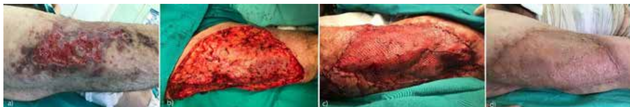
Figure 1. Surgical treatment of recurrent porocarcinoma: (a) large recurrent porocarcinoma of the thigh. (b) the patient received multiple surgeries until clear resection margins were obtained. (c) soft tissue defect covered with split-thickness skin grafts. (d) Final result after surgery

At the next follow-up, echosonographic report confirmed the advancement of the disease in the right inguinal, as well as loco-regional skin tumor recurrence. Given the suspicion of nodal metastatic disease, a lymph node biopsy with surgical excision of the recurrent tumor was performed. Histopathology of the samples from various parts of the recurrent skin tumor showed typical porocarcinoma ( Figure2 ), except in one sample where a pleomorphic tumor with sarcomatoid morphology (CK-positive) was found. A lymph node biopsy found metastatic deposits in parenchyma as well as in the lymphatic vessels in the surrounding perinodal fat tissue. Computerized tomography (CT) showed no signs of disseminated disease in the lungs or in the abdomen, in any of the subsequent follow-ups.