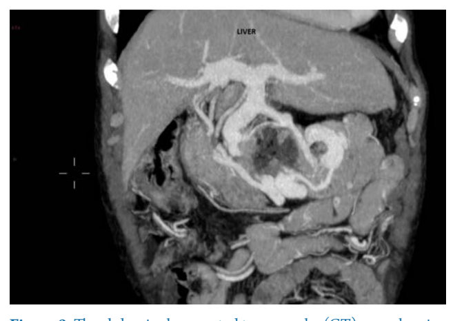
Figure 9. The abdominal computed tomography (CT) scan showing the liver.

of the pancreas was seen, indicating this is a congenital short pancreas defect ( Figures 3 and 7 ). Less importantly, bilateral renal cysts were described.