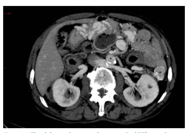
Figure 3. The abdominal computed tomography (CT) scan showing the aorta (A), the spleen (SP), the head of the pancreas (P) and the renal vein (RV).

Moreover, incomplete intestinal malrotation was seen on this CT scan. Furthermore, the stomach is in the right upper quadrant (Figure 8), whereas the liver is located on the right side, with prominent left lobe which extends up to the left hypochondrium (Figure 9).