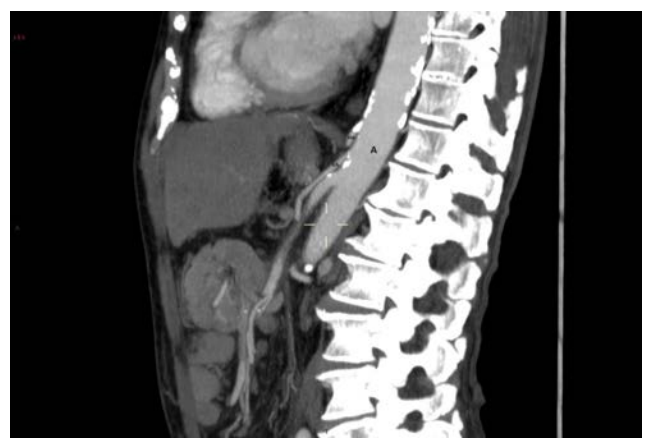
Figure 4. The abdominal computed tomography (CT) scan showing aorta (A), hepatic artery (HA) and splenic artery (LA).