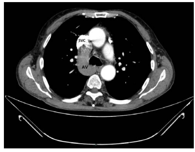
Figure 2. The abdominal computed tomography (CT) scan showing the superior vena cava (SVC) and the azygos vein (AV).