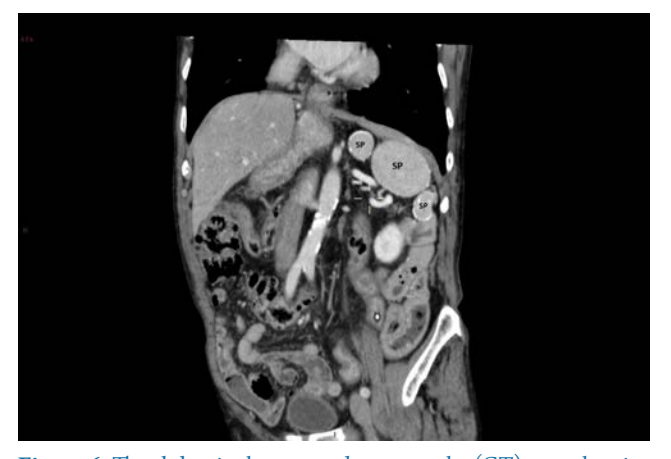
Figure 6. The abdominal computed tomography (CT) scan showing multiple spleens (SP).