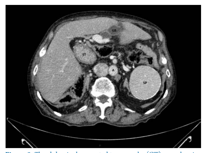
Figure 8. The abdominal computed tomography (CT) scan showing the stomach (ST), the gall bladder (GB), the aorta (A), the spleen (SP).