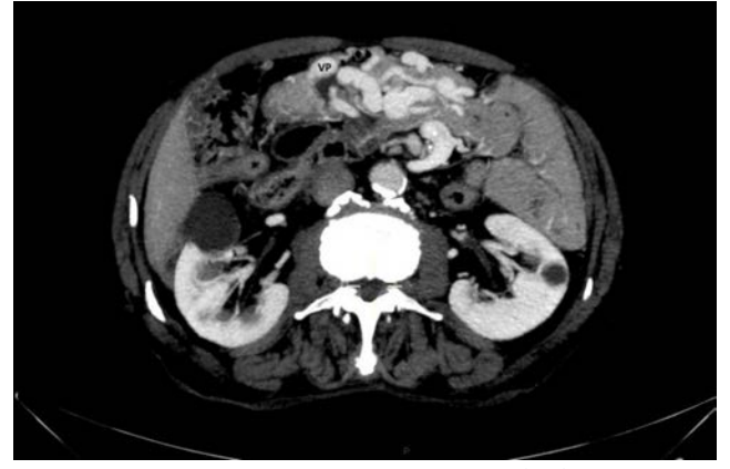
Figure 5. The abdominal computed tomography (CT) scan showing portal vein (VP).