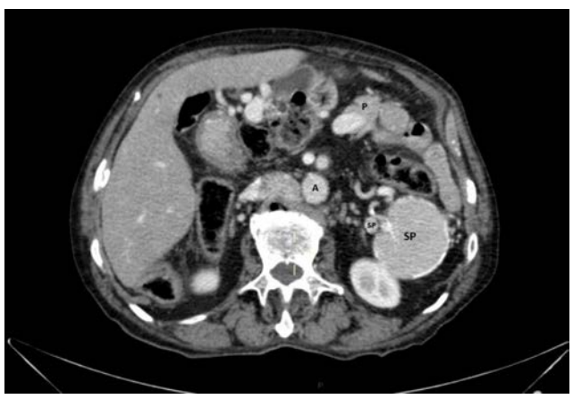
Figure 7. The abdominal computed tomography (CT) scan showing the aorta (A), the head of the pancreas (P) and spleens (SP).