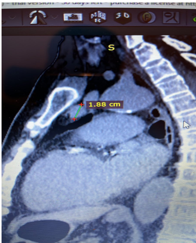
Figure 2. Ectopic parathyroid gland in the anterior mediastinum (MSCT; image shows only the surgical field; no patient-identifying features are visible)

The most common location of this type of parathyroid ectopy is the aortopulmonary window, either behind the pulmonary trunk or in front of the tracheal carina. In the rarest cases, mediastinal parathyroid glands are found within the pericardium. A multicenter study conducted in 8 European medical centers found that 19 parathyroid glands (0.24% of all glands) in 7,869 HPT patients were located in the aortopulmonary window region. In addition to these, another 181 patients (2.3%) were found to have pathologically altered, ectopic mediastinal parathyroid glands. Out of 19 patients with aortopulmonary window parathyroid tumors, three had an initial misdiagnosis of a mediastinal tumor, which was removed in the first surgery. Seventeen patients with ectopic parathyroid glands in the aortopulmonary window underwent bilateral neck exploration as well. The final results showed that 12 of the ectopic mediastinal glands were supernumerary: 4 originated from the superior parathyroid glands and 1 from an inferior parathyroid gland (62).