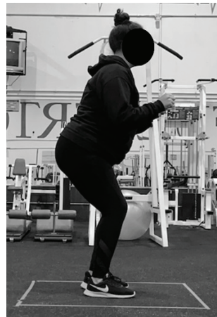
Figure 2. The Athletic Position Participants Were Required to Maintain Once They Explosively Popped Up from the Ground from Various Prone Positions

2014). Participants had the four positions explained to them, were given a visual demonstration, and then were placed in each position so they understood the expectations.