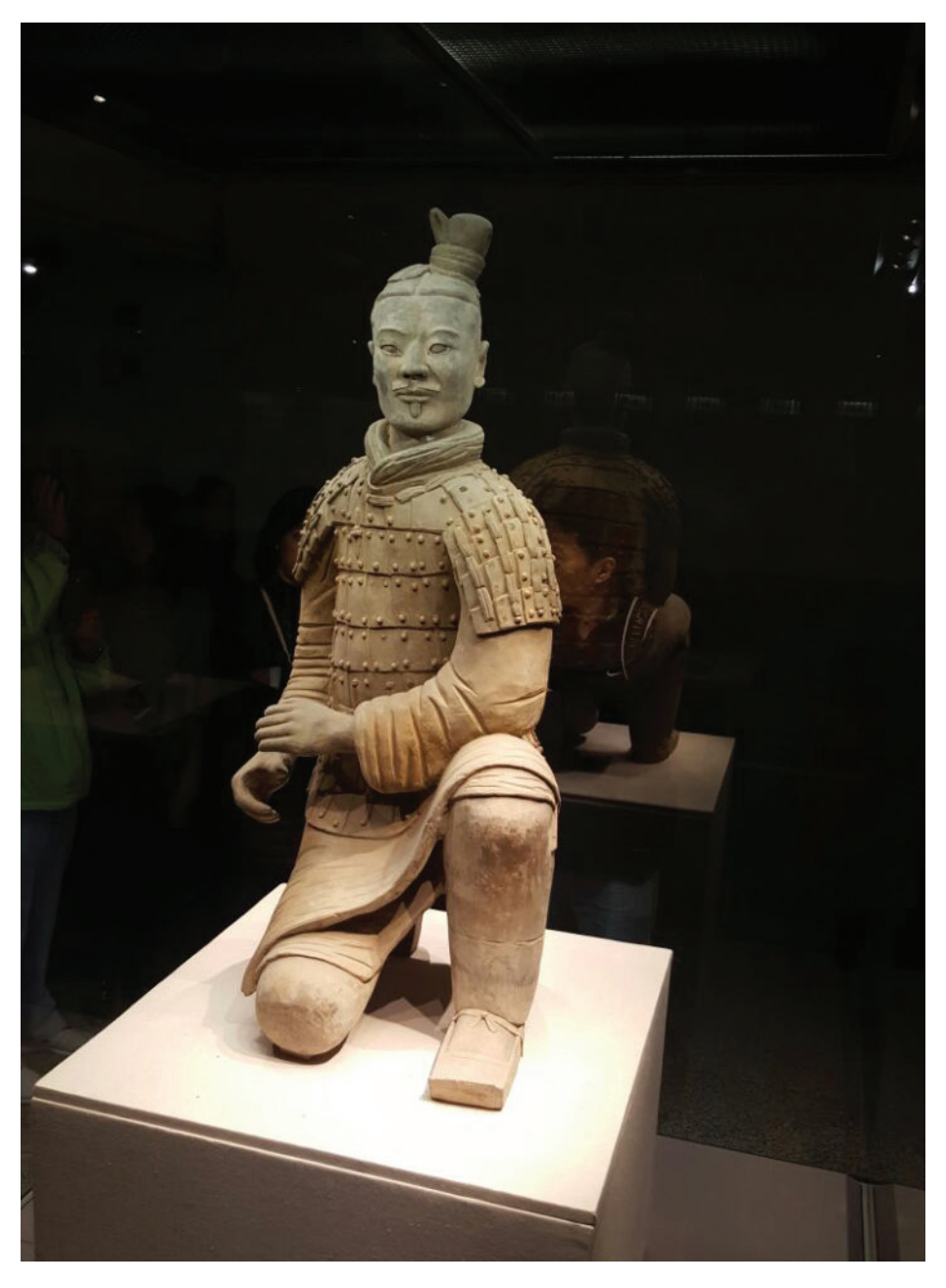
Xian warrior sculpture made of terracotta, in the vicinity of Xian, the city in the Province of Shaanxi