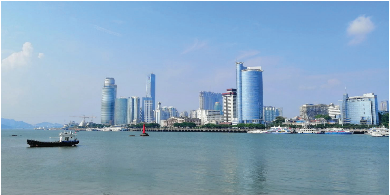
View of Gulangyu Island, which is in the UNESCO World Heritage list, Xiamen, the Province of Fujian

ing correct choices in the context of modernization requirements while studying, researching and applying traditional culture. Adhering to the principle of making the past serve the present and learning from the past, we should carry forward the traditional culture in a discriminative way. We should promote the integration of traditional culture and the contemporary culture in creative transformation and innovative development. All countries around the world should respond to the new requirements of the progress of the times, strengthen the harness of the relevance of their own histories and cultures to the present times, carry forward the spirit of fine traditional culture that transcends time and space, transcends