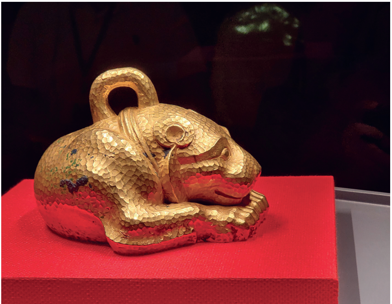
One of exceptionally valuable exhibits from the display in the Nanjing Museum