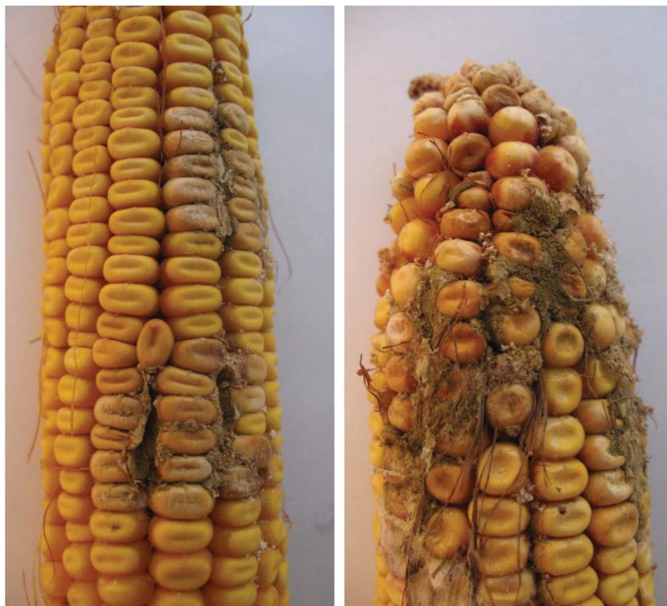
Figure 1. Olive-green powdery mould ( Aspergillus flavus ) on maize ears injured by ECB ( Ostrinia nubilalis )

Precipitation factors as indicators of climate conditions in the study period show that conditions were arid and semi-arid during 4–5 and 1–2 out of 6 months, respectively, in the growing seasons of 2008–2012 (Table 1). Exceptionally, climate conditions in June 2009 and May 2012 were semi-humid.