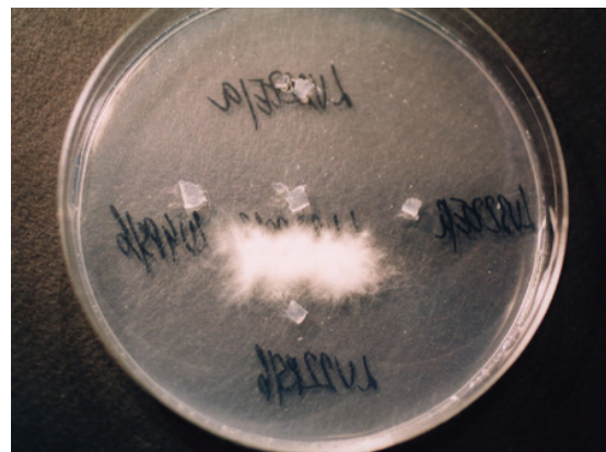
Figure 3. F. oxysporum - heterokaryon compatibility in the form of visible heterokaryon (abundant aerial mycelium) and heterokaryon incompatibility (without aerial mycelium) between fragments of nit mutants (Krnjaja, 2005)

Vegetatively compatible nit mutants can complement one another in a following way: anastomosis is formed between two hyphae, genetic material is exchanged and cells with several nuclei or heterokaryons are formed. The phenotypical recognition of the formation of heterokaryons is easy because a dense white aerial mycelium is formed in the area where colonies come in contact (Correll et al., 1987) (Figure 3). The complementation test of nit mutants is performed on the minimal medium (MM) that contains nitrate as a nitrogen source. The pairing of two strains occurs on this medium - one strain is of the nit1 type and the other is of the NitM type or nit3 , if NitM was not isolated from the same strain of the species.