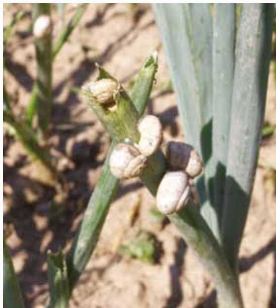
Figure 3. Bites and infiltration of white snails into green onion leaves

The most complete data on damage caused by white snails were collected in a study of introduced invasive populations in South Australia (Baker, 1986, 1996, 2002; Barker, 2002; Leonard et al, 2003). White snail causes significant economic damage on cereals in that country, developing populations of such density that yields are reduced, harvest machinery suffers clogging and grain becomes polluted. Besides, it damages seedlings of wheat, barley, oleiferous crops, carrot, annual medicinal plants, alfalfa, clover, pea, bean and ornamentals. On artificial pastures, cattle are repelled from grazing plants with contaminated slimy deposits. In the United States (Michalak, 2010; White-McLean, 2011), C. (C.) virgata is considered an important pest of cereals and nursery plants, a cause of contamination of cereal grains and damage of harvest machinery. Cereal pollution is caused by increased moisture during storage and stimulation of secondary infections with pathogens that release toxins.