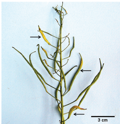
Figure 4. Damaged pods of oilseed rape change their colour, often deforming, drying and cracking

During our examination of infested pods, special attention was paid to detecting damage caused by the cabbage pod weevil Ceutorhynchus assimilis , (syn. C. obstrictus ), which is important for infestation intensity of D. brassicae . In this study, damage caused by that weevil species was not observed. A single larva of C. assimilis was found in the total of 773 examined pods, so the correlation between these two species was not determined. Similar observations had been reported in the Czech Republic (Kazda et al., 2005), while other literature data show that the midge uses openings made by C. assimilis for oviposition (Åhman, 1987; Pavela et al., 2007; Aljmlj, 2007; Williams, 2010).