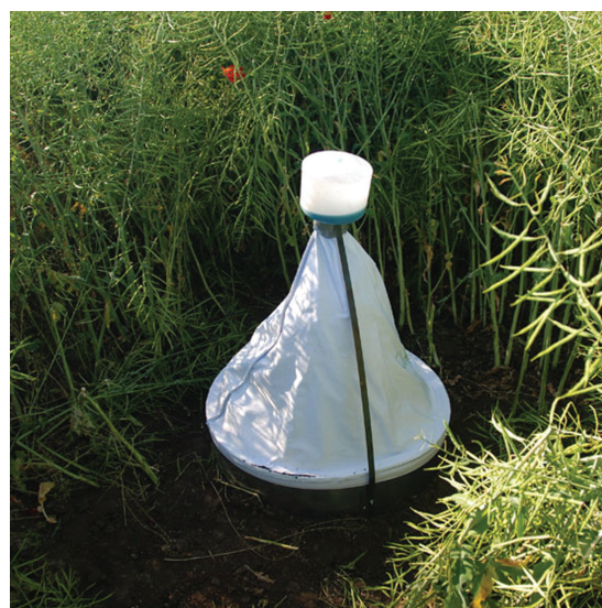
Figure 2. An emergence trap used to monitor the emergence of D. brassicae from the ground

D. brassicae midges developed two generations per year on the trial site and overwintered in the larval stage in cocoons in soil, as they do in most other European countries (Williams et al., 1987; Ferguson et al., 2004;