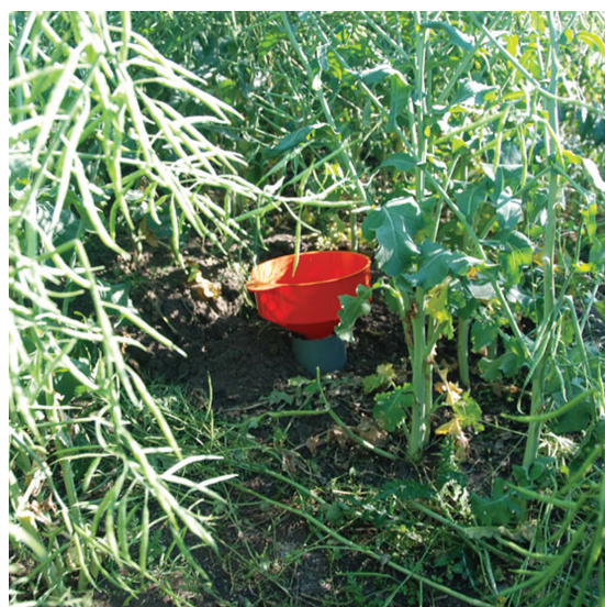
Figure 1. A funnel trap used to monitor the time when larvae leave pods and go into soil

Yellow Water Traps (YWT), Syngenta type, were used to detect the emergence of first generation adults of D. brassicae . They were set up in four places in the middle of the field at 50 m distance.