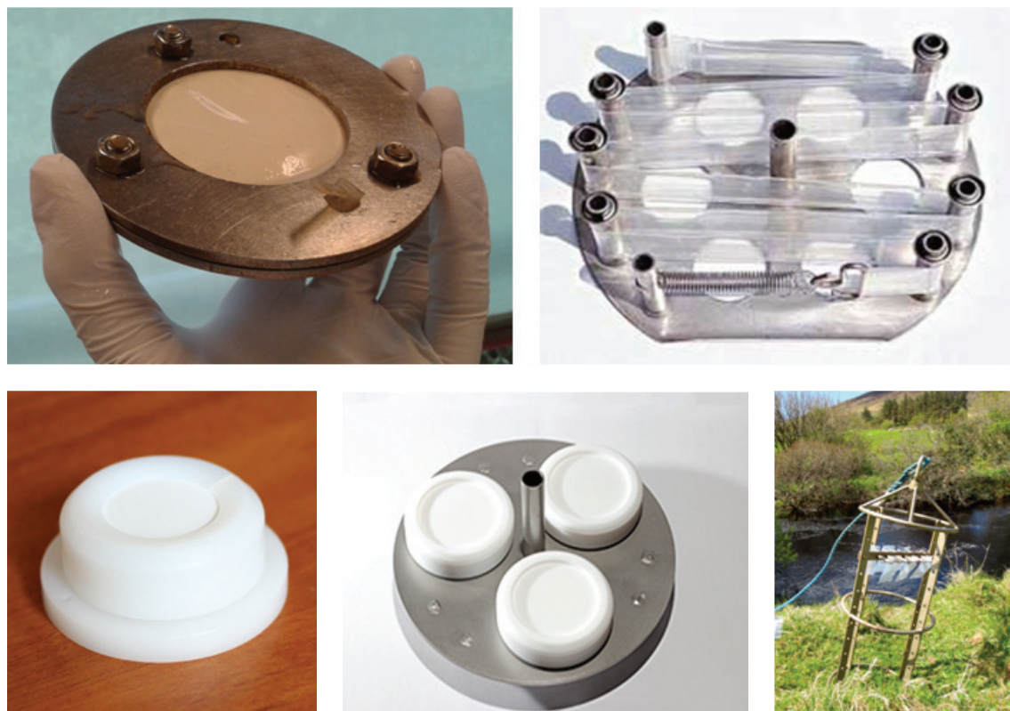
Figure 1. Passive sampling devices

To enable separation of a compound of interest out of a sorbent to the greatest possible extent, methanol and a mixture of dichloromethane and acetonitrile are used as eluents (Sun et al., 2008) or a mixture of acetone and methanol. One of the most important procedures that precede extraction is the adding of isotopically labeled internal standard to the sample (Loos et al., 2010).