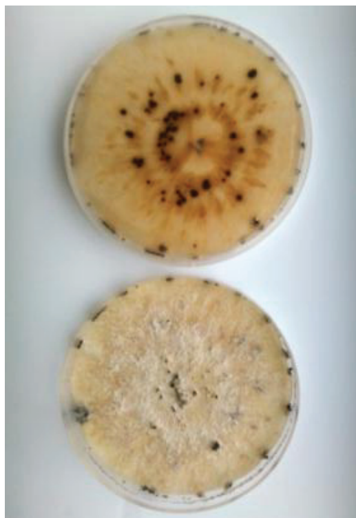
Figure 2. Colony morphology of Ph. theicola on PDA