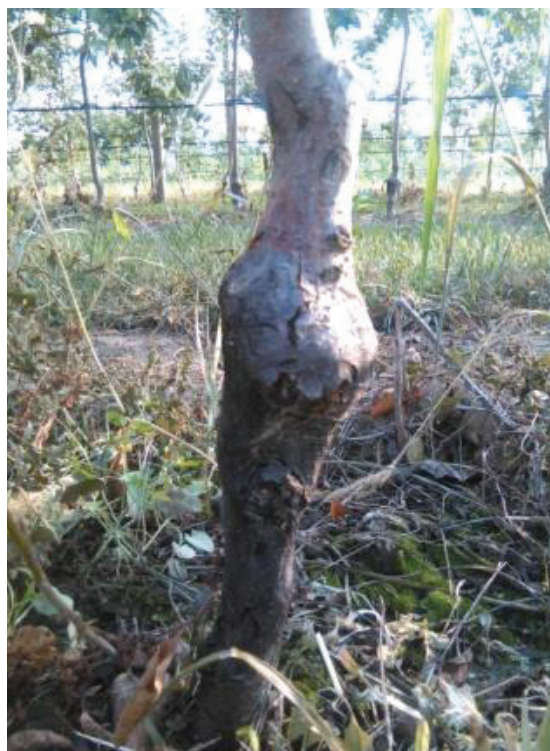
Figure 1. Symptoms of dieback and canker on an apple tree