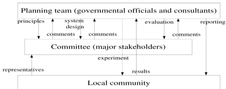
Chart 1 – Planning team with the participation of stakeholders

Urban freight actors are numerous. Public policy makers have to work jointly with a huge number of freight transportation companies, but also with a huge number of private partners and agencies interested in getting a part of the project activities. There is also a big number of private partners (companies, agencies) to whom, anyhow, some activities have to be outsourced, thus becoming more efficient and producing better economic results. That could be external agencies for data collection or maintenance of the intelligent system models. All of them could be involved in the public-private partnerships and working together.