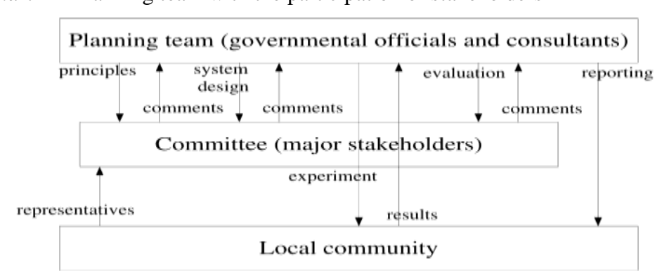
Chart 1 – Planning team with the participation of stakeholders

Urban freight actors are numerous. Public policy makers have to work jointly with a huge number of freight transportation companies, but also with a huge number of private partners and agencies interested in getting a part of the project activities. There is also a big number of private partners (companies, agencies) to whom, anyhow, some activities have to be outsourced, thus becoming more efficient and producing better economic results. That could be external agencies for data collection or maintenance of the intelligent system models. All of them could be involved in the publicprivate partnerships and working together.