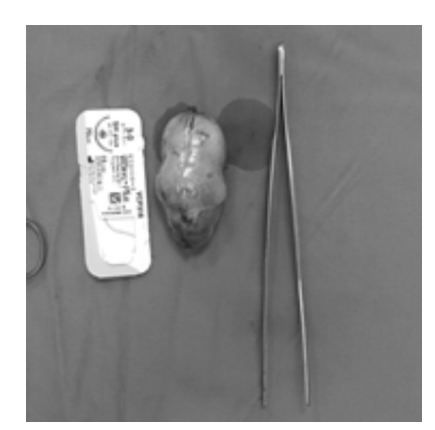
Figure 3. Extirpated tumor

tion. The postoperative period was uneventful, without relapse of the tumor. Histopathology reported regular histological and cytological built - a tumor made of spindle-shaped fibroblasts and Schwann cells, normochromic wavy nuclei, with no mitosis included in the mostly hyalinized and partially myxoid stroma, encapsulated by a thin capsule. The further immunohistochemical analysis stated s-100 positive, neuron-specific enolase, vimentin, and negative immunoreactivity to pan-cytokeratin and desmin. All this considered, the tumor was defined as a benign neurofibroma, without evidence of neurofibromatosis.