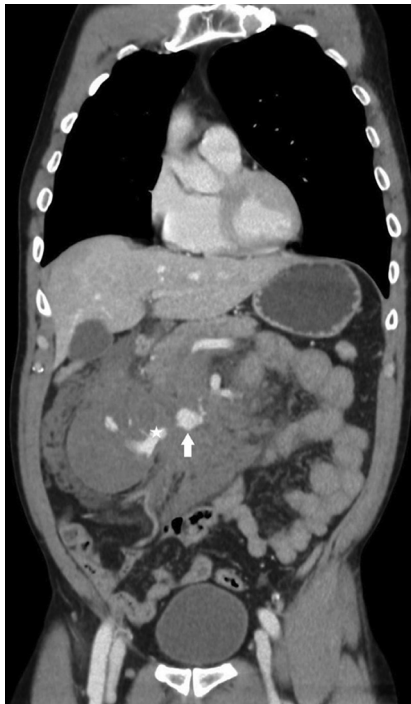
Figure 3. Contrast-enhanced abdominopelvic CT, coronal reconstruction, venous phase: Huge retroperitoneal and mesenteric hematoma with pseudoaneurysm of pancreaticoduodenal arcade (arrow) and contrast "blush" in the central region of the hematoma (star)

We decided to proceed with an urgent exploratory laparotomy. During the operation, we discovered blood and coagulum in all peritoneal recesses, along with a hematoma in the right peritoneal space extending towards the mesocolon transversum and the mesentery of the small intestine, with rupture towards the peritoneal cavity (Figure 5). To access the pancreas, we performed a