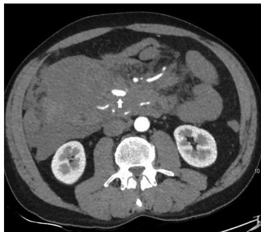
Figure 1. Contrast-enhanced abdominopelvic CT, axial image, arterial phase: Huge retroperitoneal and mesenteric hematoma located on the right side with a pseudoaneurysm of the pancreaticoduodenal arcade (arrow)

Ultrasound examination revealed a suspicious break in the antropyloric part of the stomach wall and a septate, organized mass with a diameter of about 70 mm in the right hemiabdomen, suggestive of a pseudoaneurysm, septate dense collection, or other etiology. Given these findings, an urgent CT scan of the chest and abdomen was performed, which showed a hyperdense left lobe of normal-sized liver without focal changes. The trunk of the portal vein measured 10 mm in diameter, with extension of a hematoma from the right retroperitoneum and mesentery of the intestine into the infrapancreatic region, with signs of active bleeding. The CT findings suggested bleeding from the origin of a branch of the pancreaticoduodenal arcade, likely the lower one, with a differential diagnosis of arteriovenous fistula, suspected tumor, or inflammatory type, more likely a pseudoaneurysm (Figure 1-4).