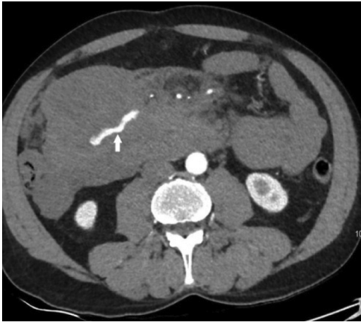
Figure 2. Contrast-enhanced abdominopelvic CT, axial image, arterial phase: Huge retroperitoneal hematoma with contrast "blush" in the central region of the hematoma - a CT sign of active arterial bleeding (arrow)