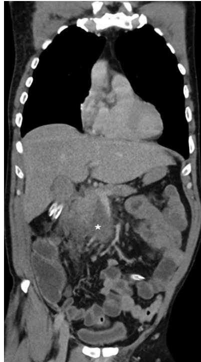
Figure 4. Postoperative contrast-enhanced abdominopelvic CT, coronal reconstruction, venous phase: Minimal residue of mesenteric hematoma (star) without signs of active bleeding and pancreaticoduodenal pseudoaneurysm