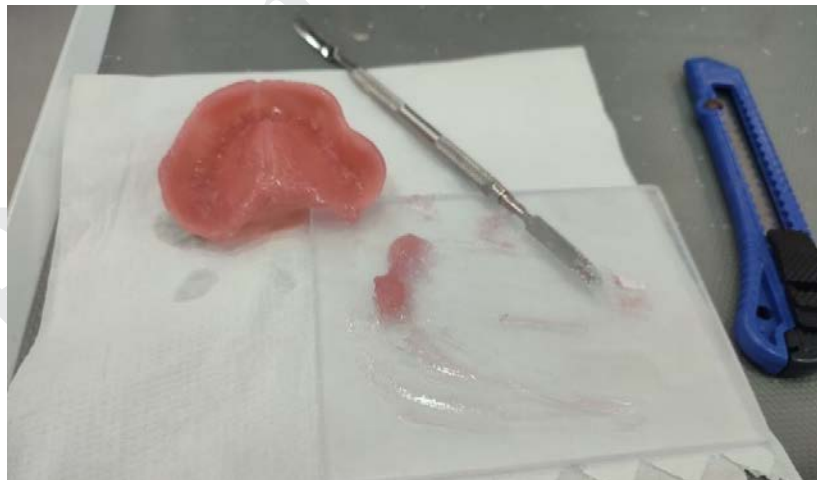
Figure 2. Mixing mass for soft lining and placing it on the base of the prosthesis.

After applying the adhesive, the prosthesis is ready for the application of the base material. Using a glass plate and a metal spatula, the soft lining material is mixed thoroughly. The mixed mass is then evenly distributed and applied onto the base of the prosthesis (Figure 2).